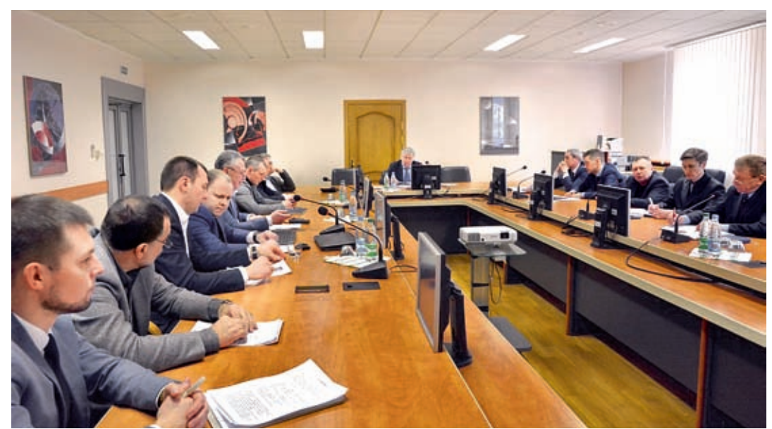
Technical seminar at SPA Relenerad

We would like to thank SPA Belenergo for their invitation and the seminar organization at the highest technical level!