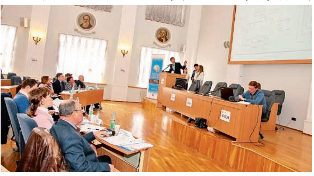
Preliminary round of the power industry league in the Vth international Case-in Engineer's Championship at NRU MPEI

On 15 and 16 February 2017, the XIV annual Methods and Insulation Control of High-Voltage Equipment Conference was held in Perm. Diagnostics of high-voltage equipment by