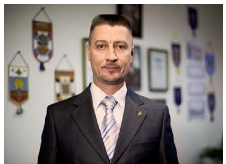
In the Moscow Region Duma, chaired by the Committee on Economy, Entrepreneurship and Invest-