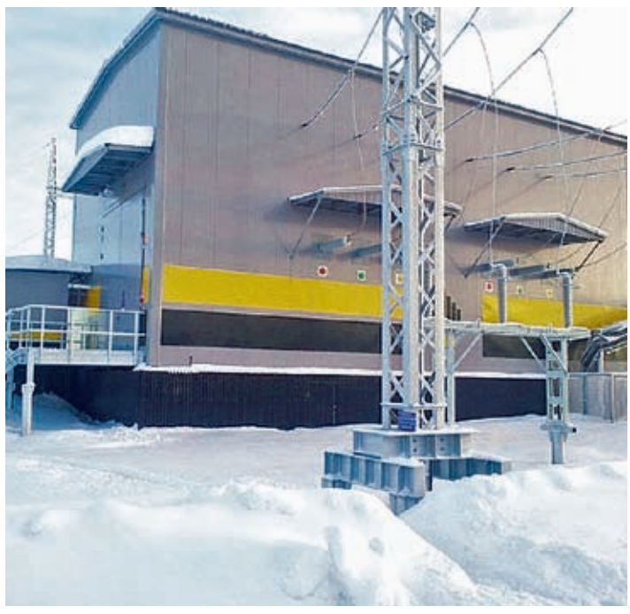
SF6 gas insulated switchgear