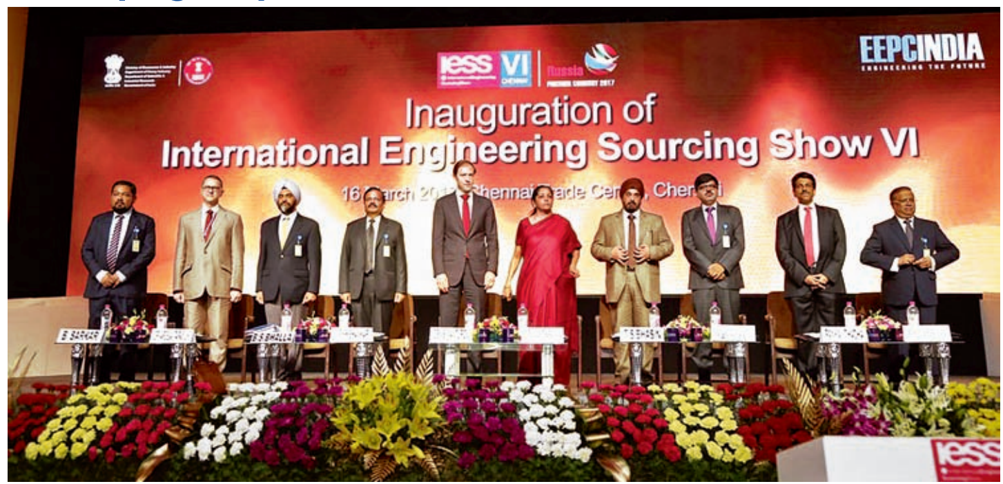
The grand opening of IESS 2017