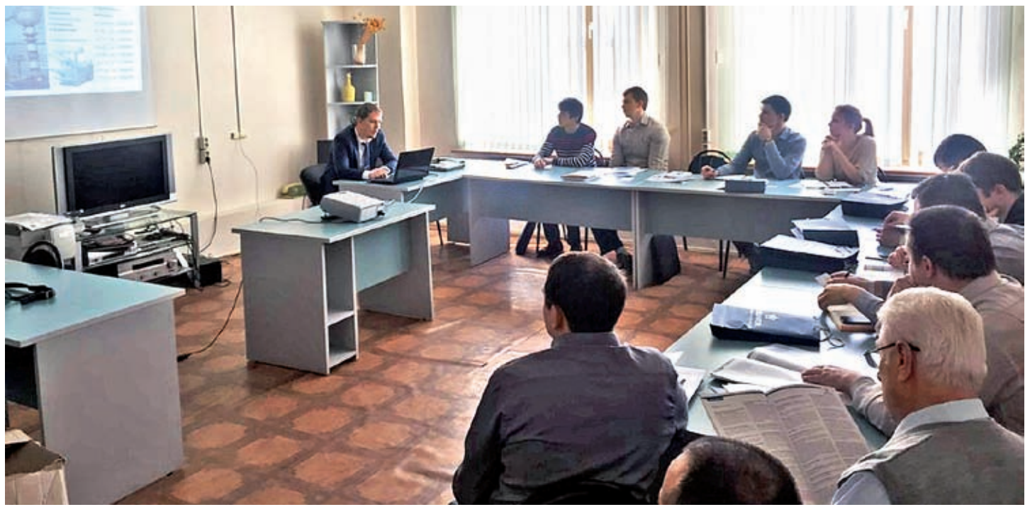
Izolyator seminar at Electrozavod JSC

Izolyator gave a seminar for specialists of several departments of Electrozavod JSC plant in Moscow.