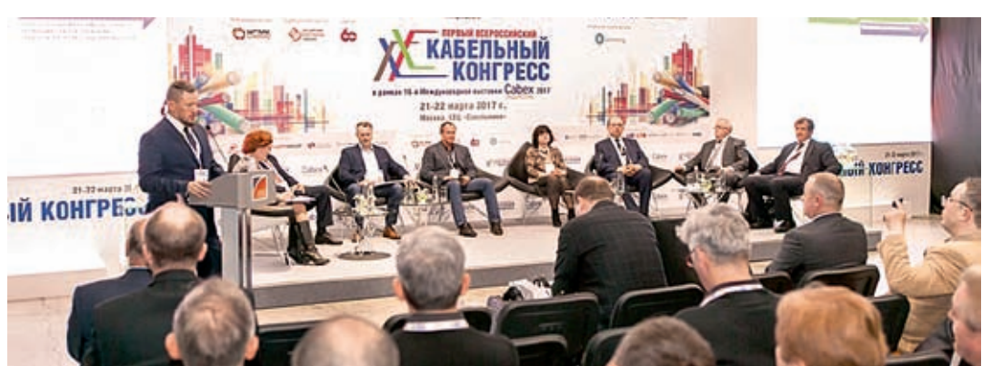
The first all-Russian Cable Congress held during Cabex 2017