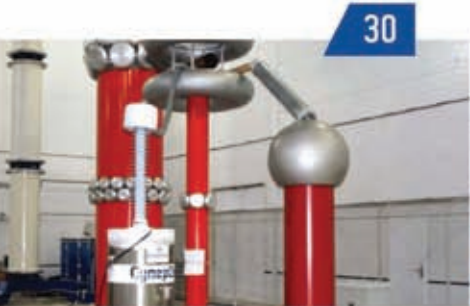
INNOVATIONS HV bushing tested at -200 °C for the first time in Russia