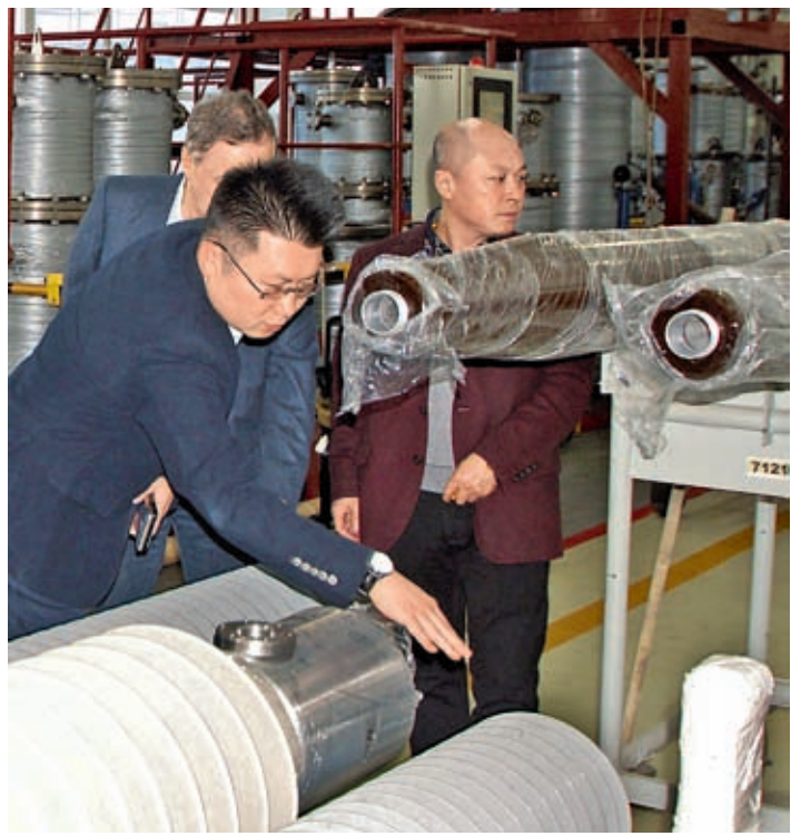
Representatives of HSC at the assembly shop of Izolyator