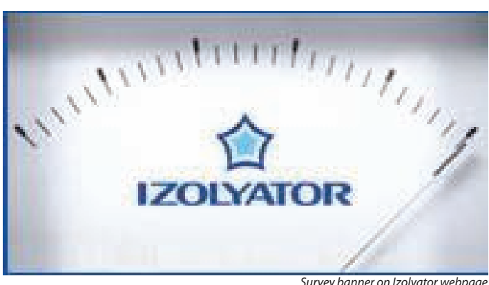
Survey banner on Izolyator webpage

Izolyator launched a new survey addressed to its partners to evaluate the quality of interaction with the company and its key business proc-