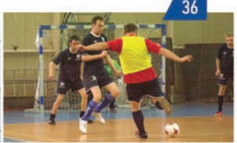
PULSE OF THE COMPANY Izolyator Spring Futsal Cup