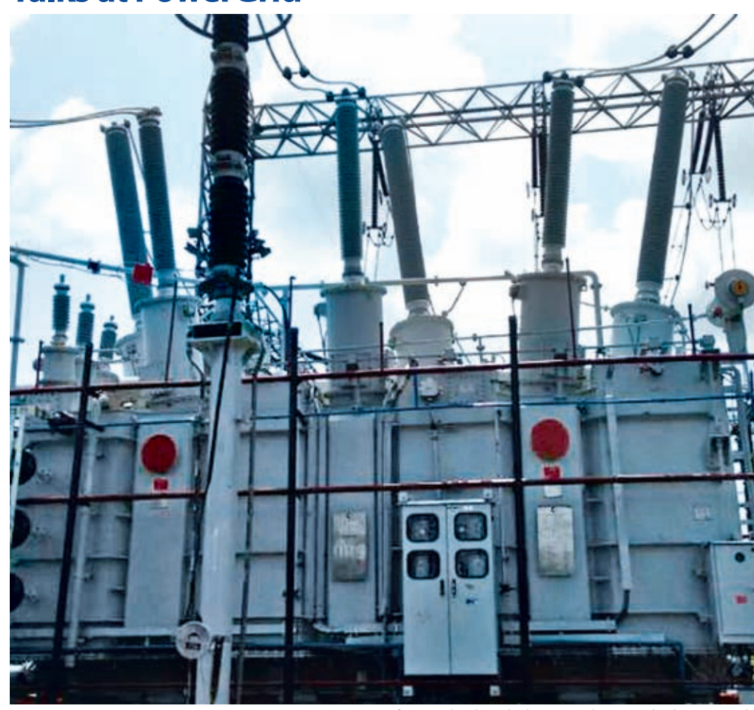
Transformer with Izolyator bushings at 400 kV Bamnauli Substation in India