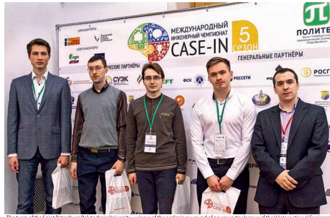
The team of the Saint Petersburg Polytechnic University - winner of the preliminary round of power sector league of the V International Engineers Championship Case-in in Saint Petersbura

There were 10 teams competing in the round: 8 — from the polytech-