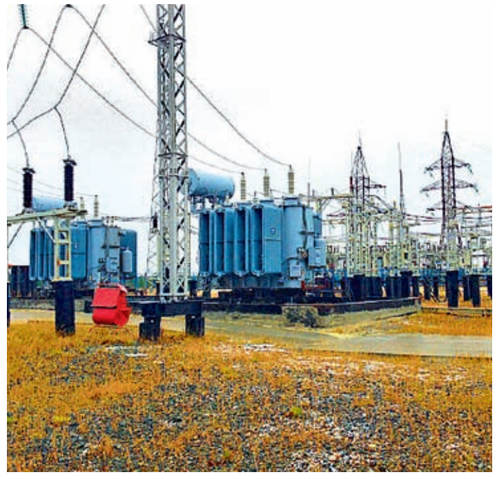
Package transformer substation