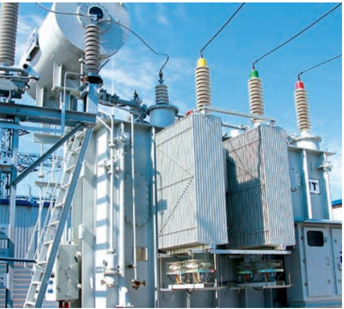
Transformer at Kuznechevskaya SS of Arkhenergo

We wish to thank Arkhenergo for their invitation and a fruitful cooperation!