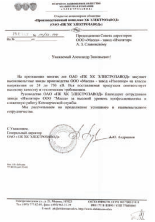
The original of the reference in Russian

We would like to thank Electrozavod JSC for their invitation and superb organization of the seminar!