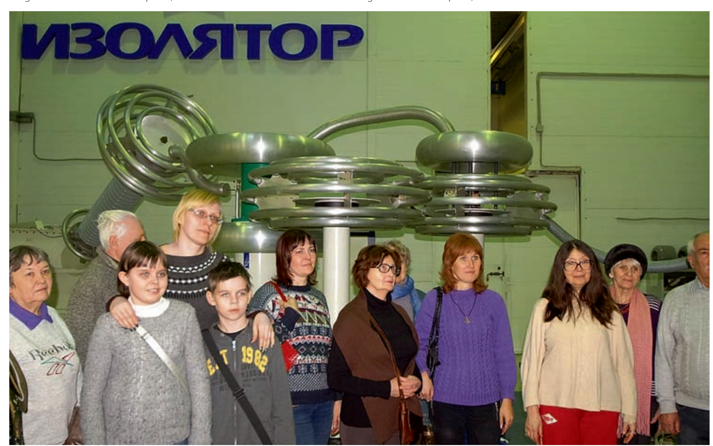
Izolvator plant tour

We appreciate the administration of Pavlova Sloboda village for including Izolyator in the industrial companies visit-list.