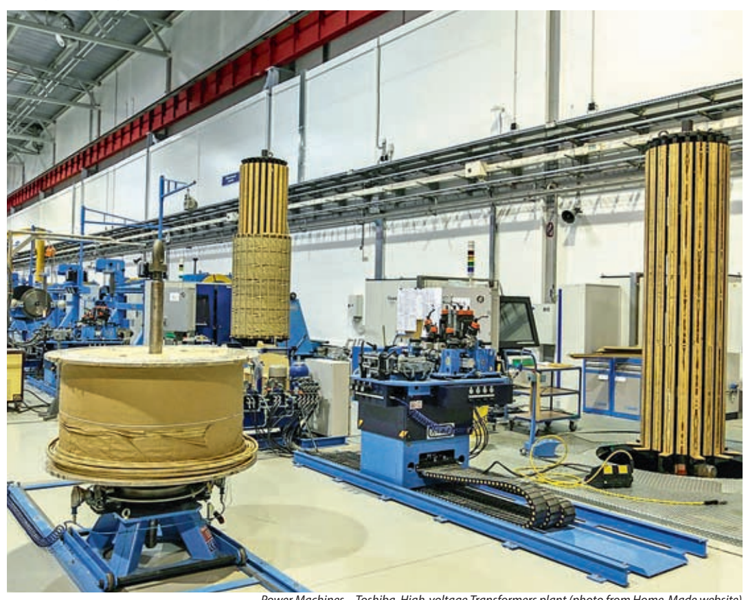
Power Machines – Toshiba. High-voltage Transformers plant

Maxim Zagrebin, Head of OEM Sales at Izolyator visited Power Machines — Toshiba. High-voltage Transformers plant in Saint Petersburg.