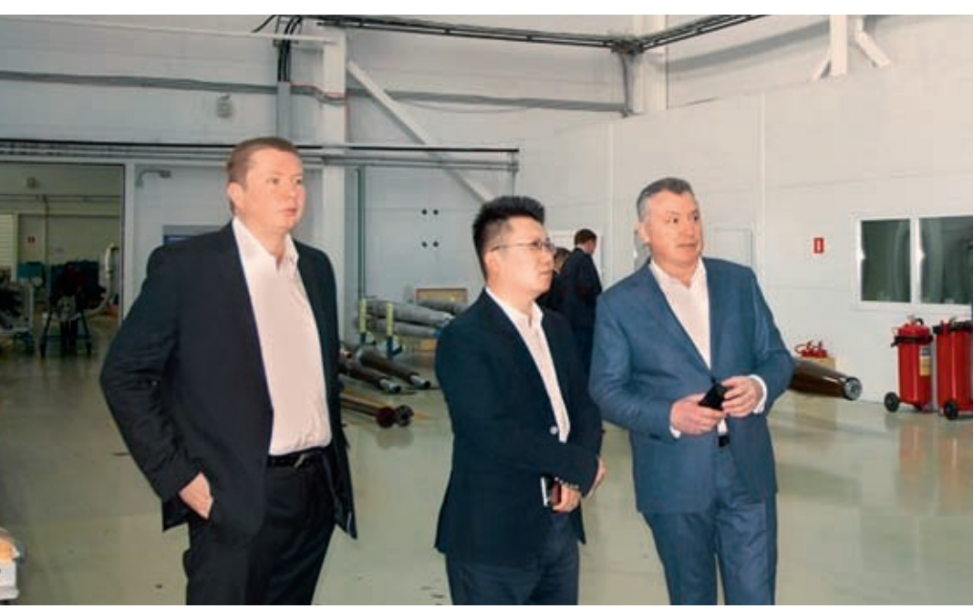
Izolyator plant tour

The hosts organized a plant tour, familiarizing the visitors with the modern technologies of production and testing of high-voltage RIP bushings. The sides held talks on cooperation development.