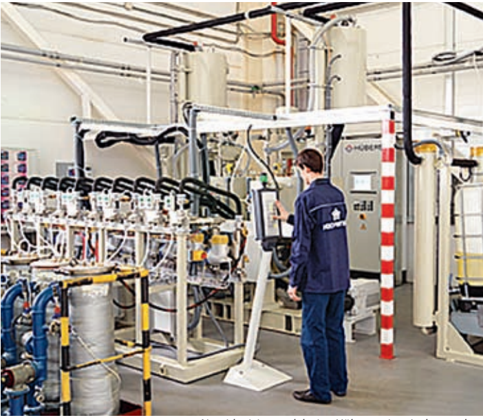
Airvoid mixing and dosing Hübers unit at Izolyator plant

equipment would allow to raise productivity, decrease costs and ensure consistent high quality products.