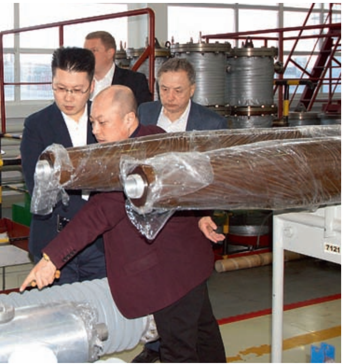
The guests are learning about design of modern high-voltage bushings