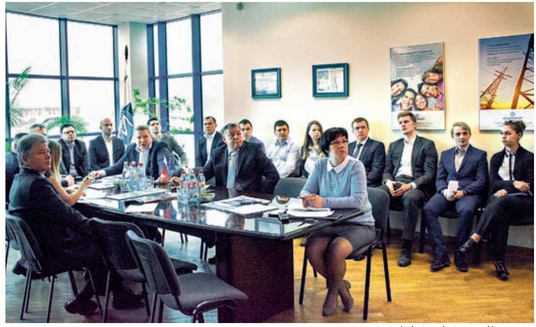
Izolyator sales team making a report

The annual report of Izolyator sales team on the 2016 results and plans for 2017 took place.