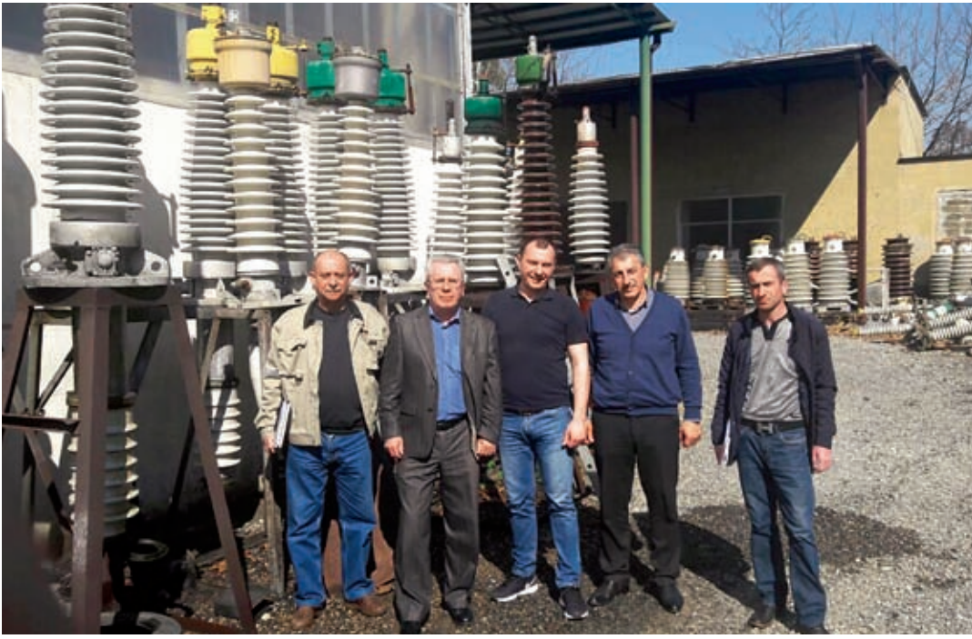
Participants at Izolyator seminar at a SS of Chernomorenergo

The specialists of Chernomorenergo familiarized themselves with the advantages, designs, installation