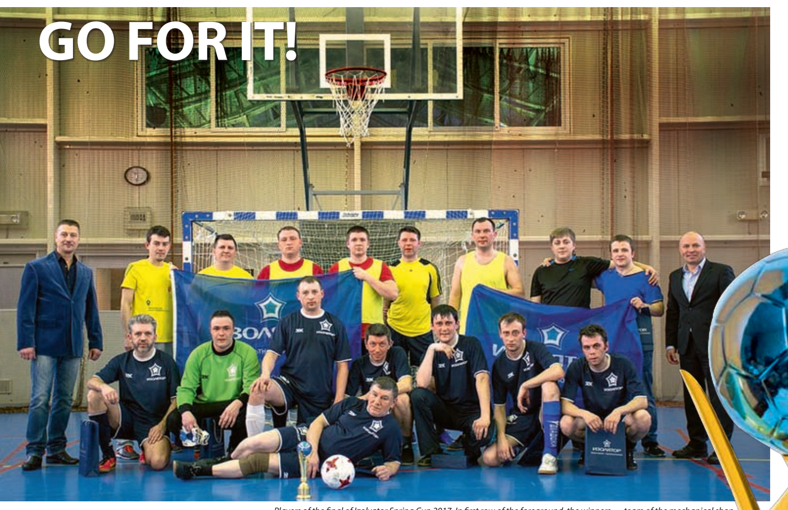
Players of the final of Izolyator Spring Cup 2017. In first row of the foreground, the winners — team of the mechanical shop

The games of the spring open futsal Izolyator 2017 Cup among Izolyator staff were played.